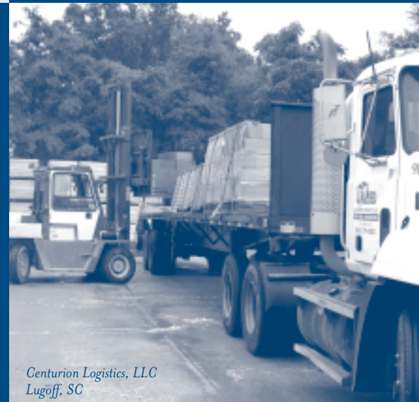
Centurion Logistics, LLC Lugoff, SC

WE WORK TO FINANCE THE ENTREPRENEURIAL SPIRIT IN SOUTH CAROLINA.